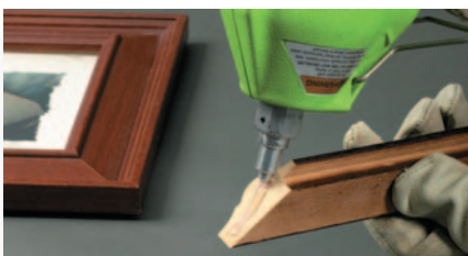
Assemble miter joints with a tough, flexible bond for long life durability.