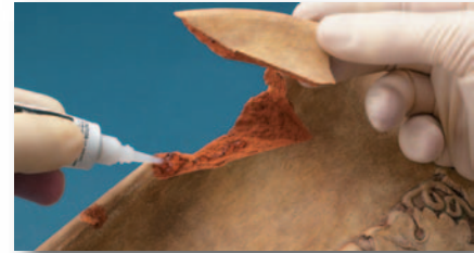
For repair of fiberglass/concrete cast pottery, 3M™ Scotch-Weld™ Instant Adhesive CA50 Gel bonds with high tensile and shear strength. Non-sagging for neat application.