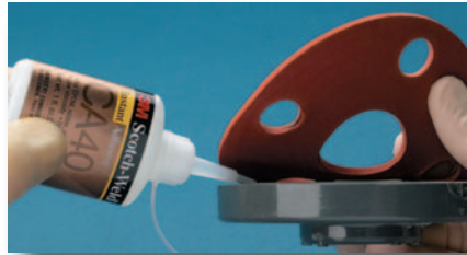
3M™ Scotch-Weld™ CA40 Instant Adhesive works on many problem surfaces where other adhesives may fail, such as EPDM rubber.

Application is easy from their own containers or through intermediate manual dispensers or automated systems. Curing requires no expensive equipment or fixturing.