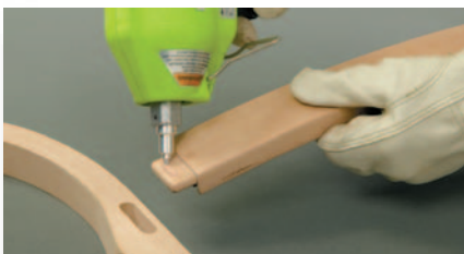
Trigger a fast, easy, and neat bead of adhesive from self-contained hand-held applicator at up to 11 pounds per hour.