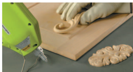
Bond simulated-wood plastic trim to wood cabinet doors with an invisible bond line.