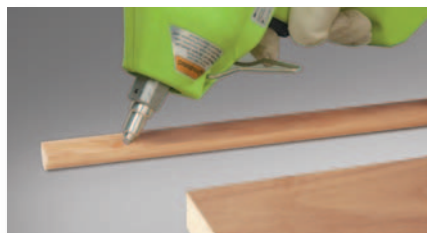
Thin, flexible bond lines help improve the fit, appearance and durability.