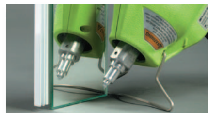
Assemble mirror components with hot melt adhesive speed and structural strength.