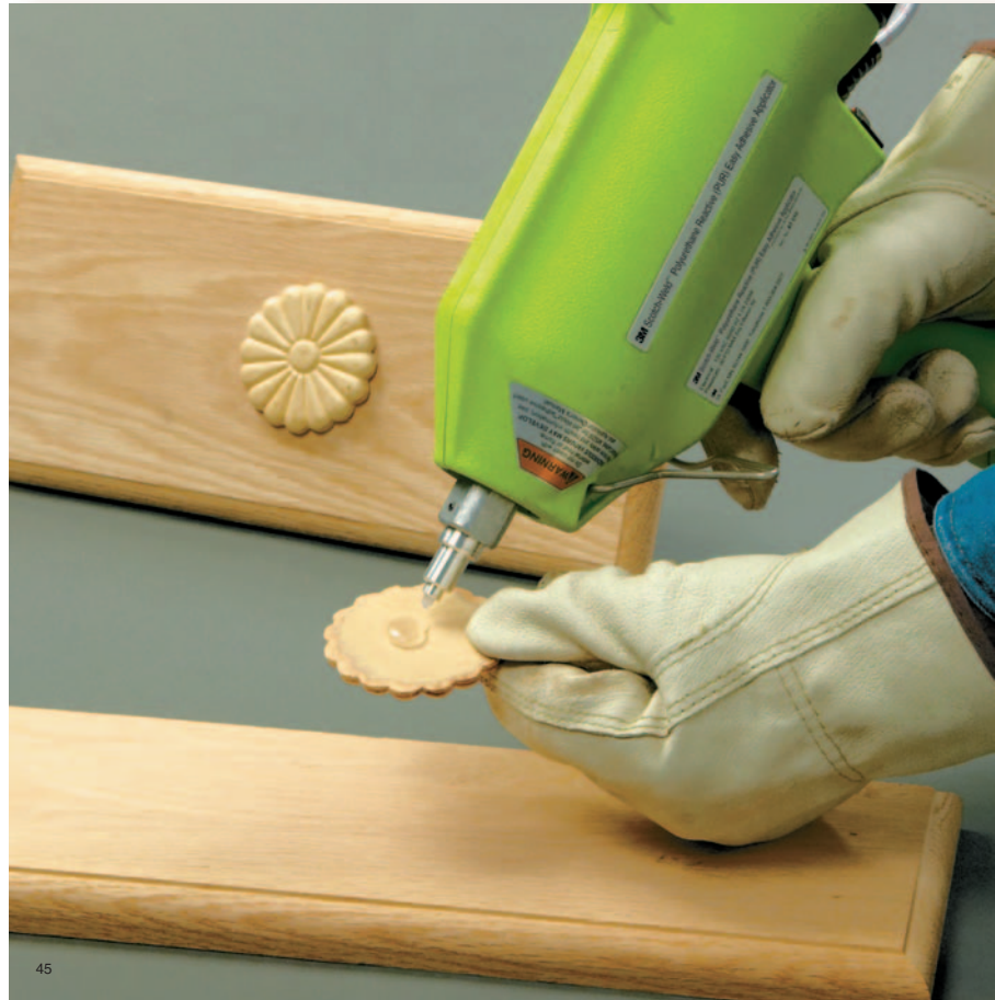
Bond wood or plastic rosettes to wood drawers without fixturing or drying time. Adhesive dispenses warm at 170°F (77°C) and can remain in the applicator at dispensing temperature for up to 40 hours.