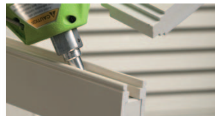
Up to 2.5-minute open time allows positioning of multiple or complex parts.