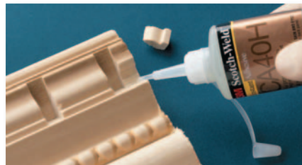
For wood and veneer repair, 3M™ Scotch-Weld™ Instant Adhesive CA40H is a high viscosity liquid for a fast void-filling bond.